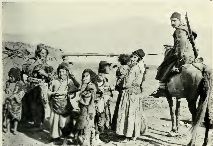
A KURDISH FAMILY AND TURKISH ZAPTIEH (GENDARME)